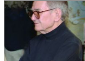
'Rooms with a View' stylish for charity