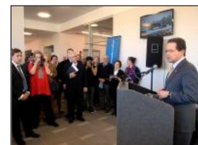
NCC opens wellness center