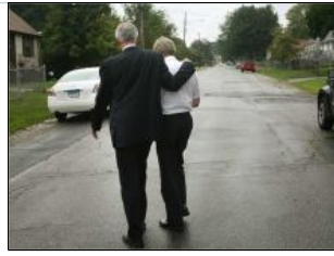
After city firefighters' deaths, changes come