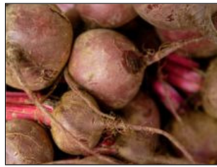
Competition grows for year-round farmers' market

"It also powerfully and poignantly, but not in a complaining way, illustrates the emotional and physical struggles of those of us in the Sandwich Generation, the 20 million Americans, like me, sandwiched and pulled between the needs of their kids and elderly parents."