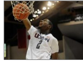
UConn's exhibition win a showcase for Drummond

"Cindy is always coming up with what I think are crazy ideas that turn out to be something good. The fact that she's performing on Broadway is unbelievable, but not that surprising.